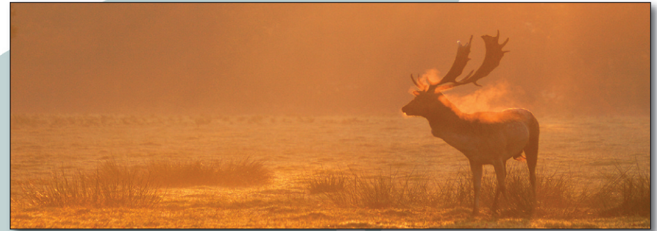
This fallow deer was captured during the autumn rut. The backlighting from the rising sun really helps to show off the body heat of this impressive buck.