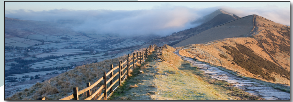
The great ridge on a cold and frosty morning with the Edale Valley to the left.