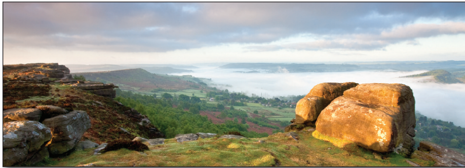
First light illuminates the rocks on Curbar Edge with spectacular cloud over the villages of Calver and Baslow in the distance.