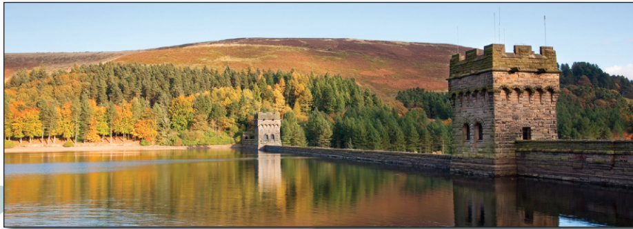
The Derwent Dams which include Howden and Derwent were constructed between 1901 and 1916 to provide water to Sheffield, Derby, Nottingham and Leicester. The project to build the dams was so large that an entire temporary village called Birchinlee was created to house the workers. This image shows the autumn colours with Howden Dam reflecting into Howden Reservoir.